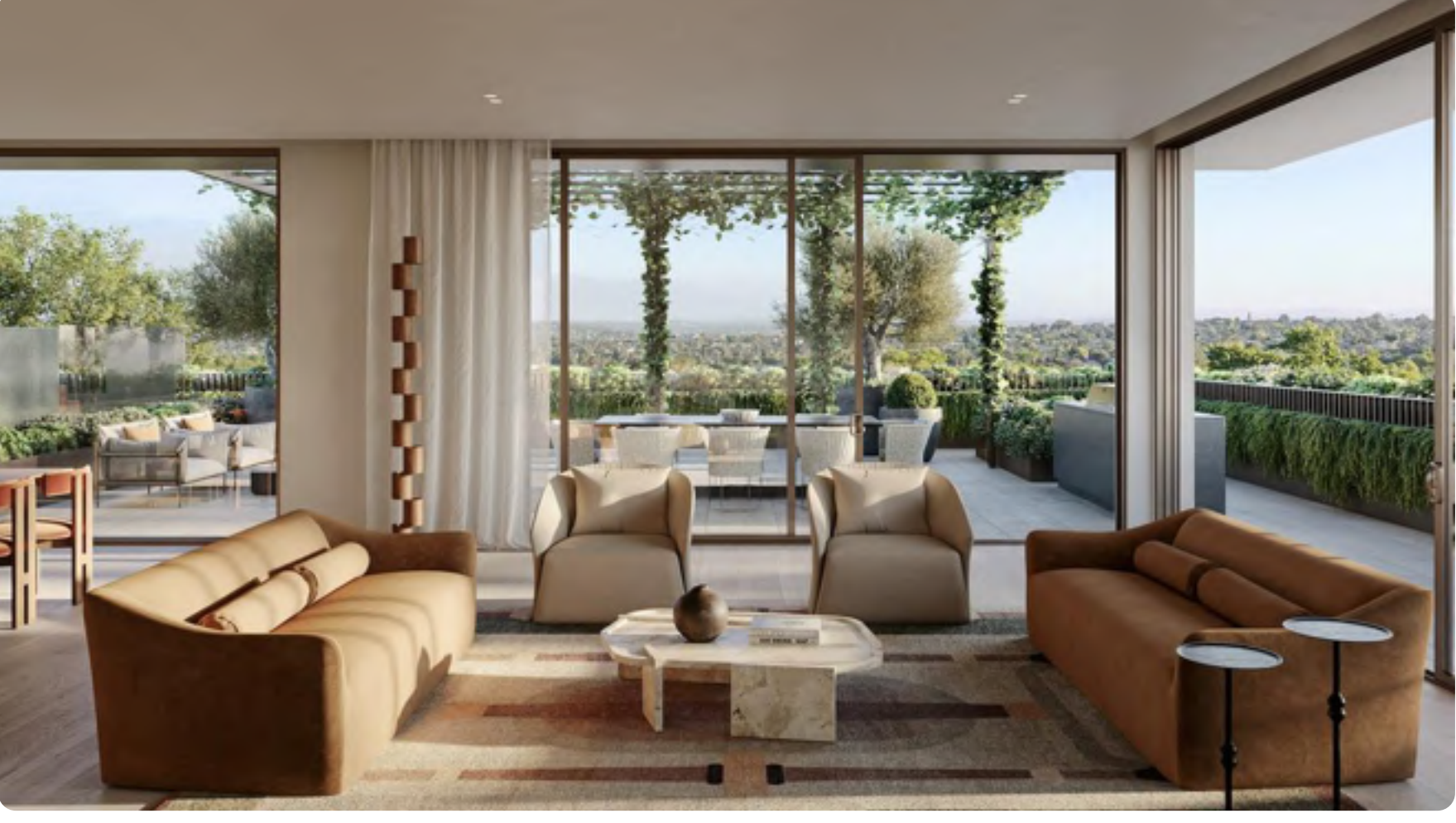
A variety of floorplans on offer will include penthouses spanning as much as 600sq m in size, one with scope for its own pool.

A mix of two and three-bedroom floorplans will be offered, all homes will have butler's pantries in their kitchens, large terraces and multiple carparks.