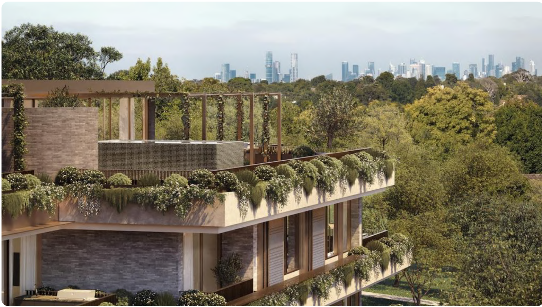
Residents of the Maleela Rise development could be set to enjoy their views for a long time if plans for it to help improve wellbeing and longevity pay off.

A consortium backed by billionaire James Packer have revealed their vision to turn a Balwyn nursing home into a life-extending luxury apartment complex.