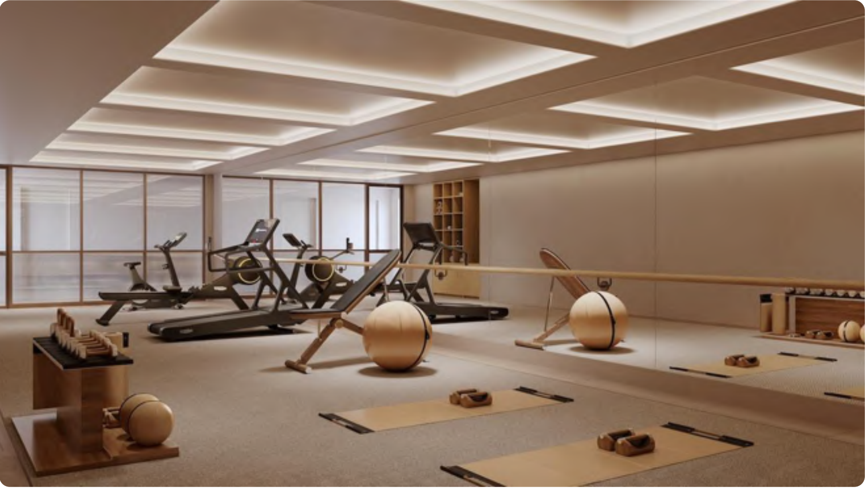
Fitness training forms part of the plan to help keep residents at Maleela Rise in top shape.