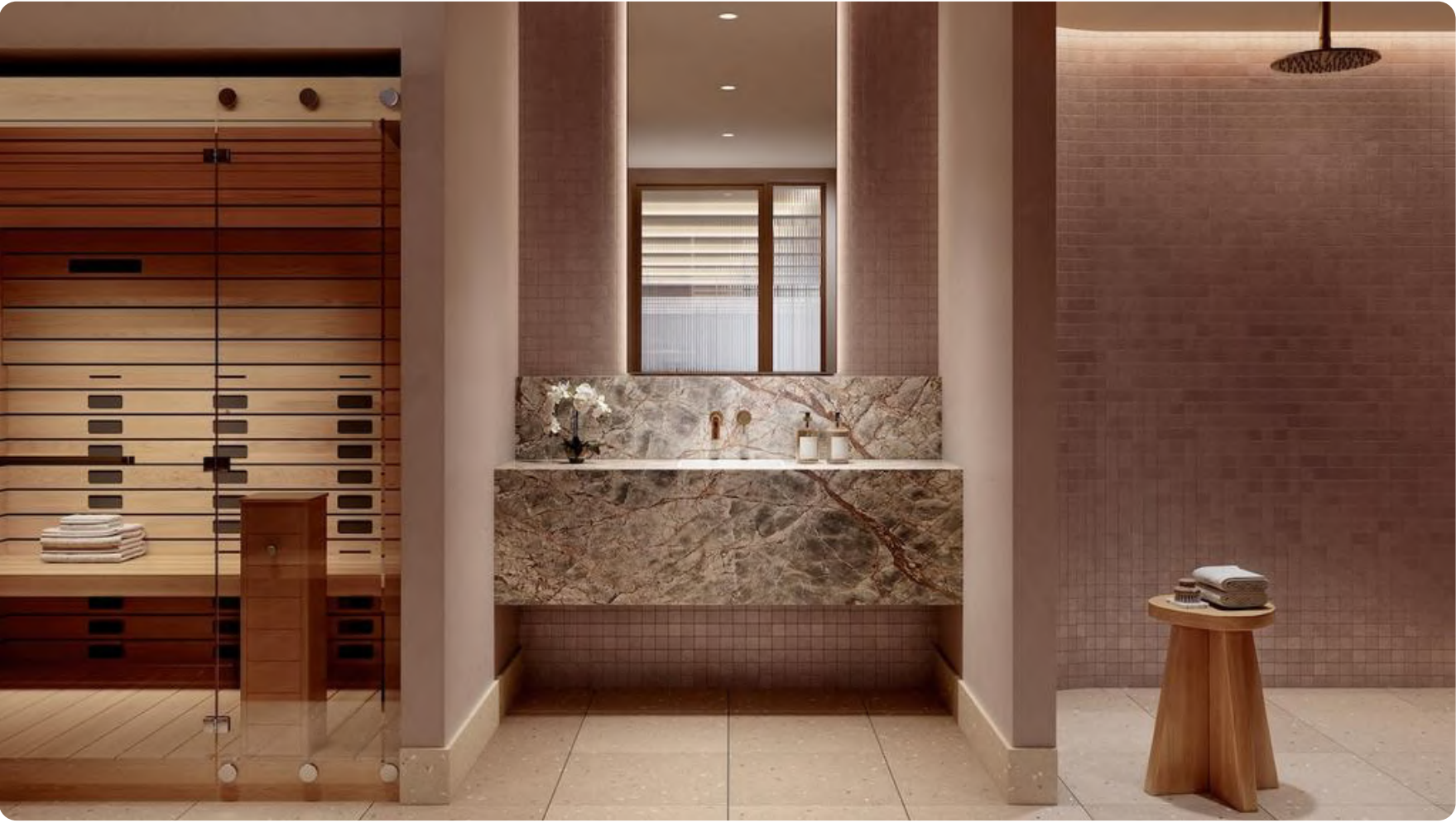
Sauna's and cold showers are also on the list of physical therapies intended to help promote a long and healthy life.

"We have focused on providing features within the development which not only promote physical health, such as the gymnasium, saunas and cold shower, but also to create opportunities for socialisation and the building of friendships through our club lounge facility, and relaxation and enrichment in our library and reflection garden," he said.