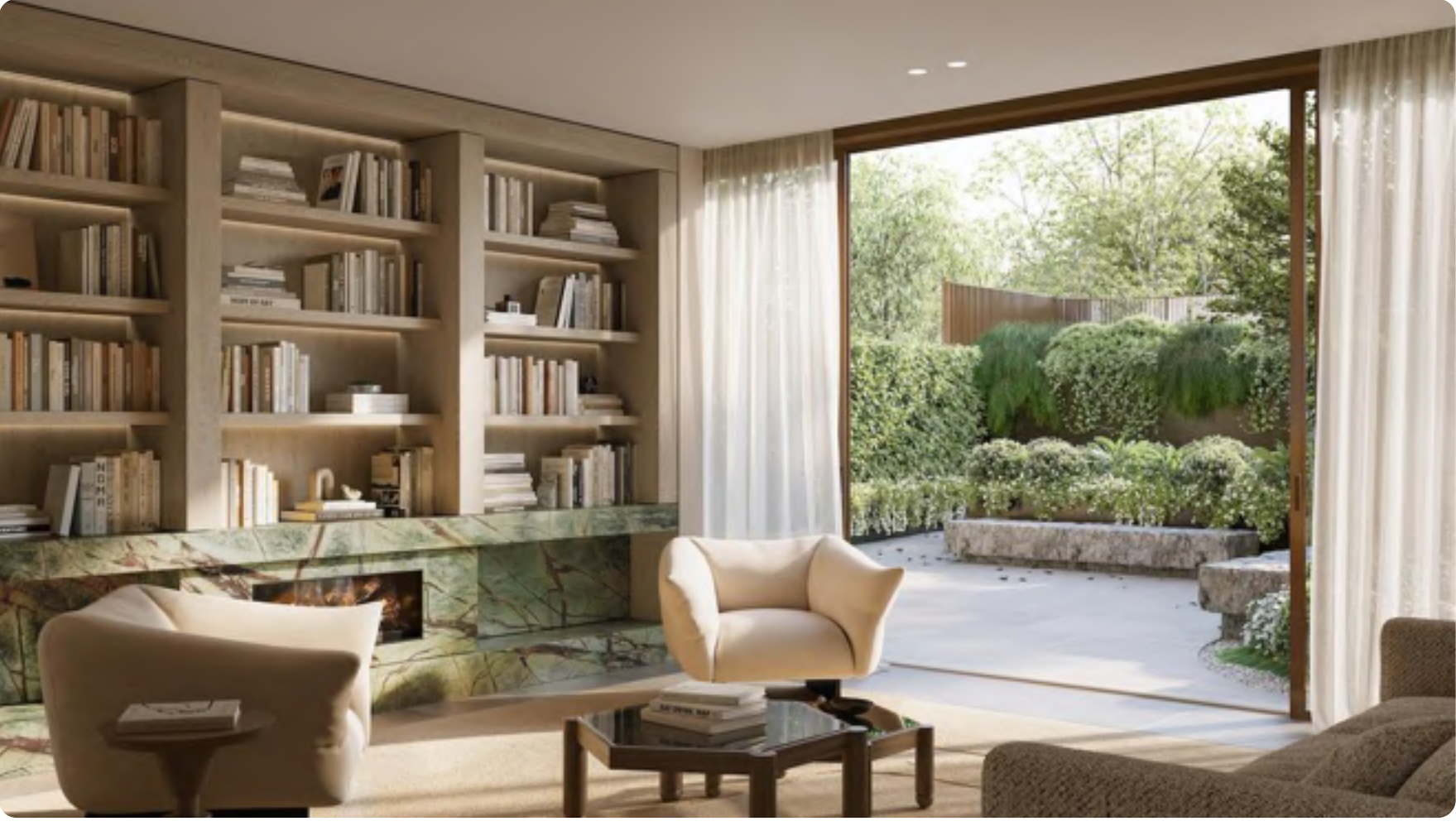
A library and reflection garden are also among the features intended to keep owners' minds in good working order.

After previously working on One Barangaroo, the tallest tower in Sydney and home to one of the nation's few six-star hotels, he added that the 31-apartment complex in Balwyn to be named Maleela Rise was also intended to create a balance between hotel luxury and a sense of home.