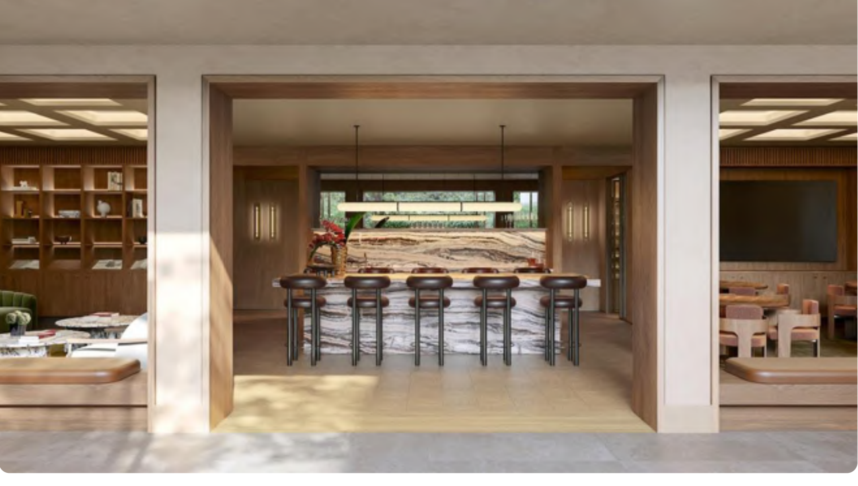
Social spaces to ensure engagement with neighbours are among the project's intended ways to maintain good wellbeing.

European oak flooring will be complemented by marble and travertine throughout the homes, while many residences will also have fireplaces and bars.